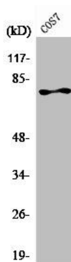
Western Blot analysis of COS7 cells using PKC zeta Polyclonal Antibody.